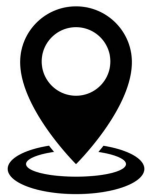
Surveying and Mapping